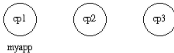
Figure 9.1: Application myapp - Situation 1

Similarly, the application must be stopped by calling application:stop(Application) at all involved nodes.